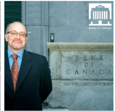
Financial Security Data Review for the Bank of Canada

Visit our website for our full portfolio of projects.