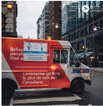
Business Process Review and Modelling Simulation Services to Canada Post Corporation