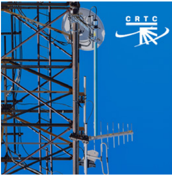
Automation of Geospatial Data Processing and Quality Assurance Review for the CRTC