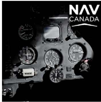
Business Processes and Data Management for NAV Canada